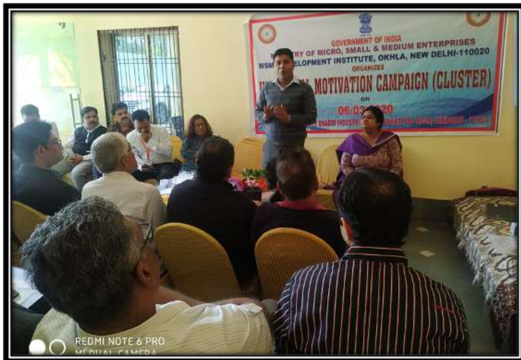
Officer, MSME-DI, ND giving presentation on MSME Schemes During IMC Cluster on 6 th March, 2020 at Bhakri Indl. Area, Faridabad