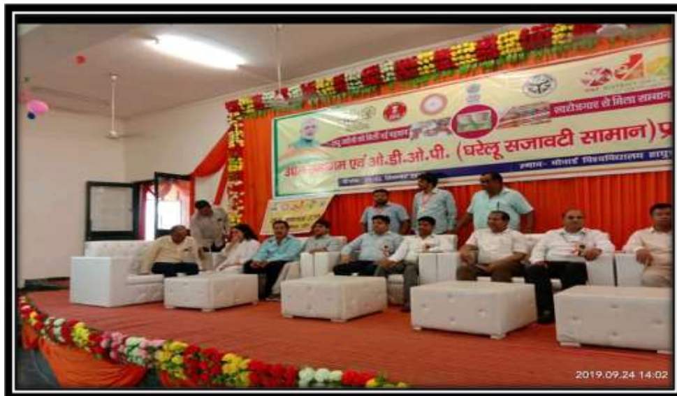
Dignitaries sitting on the Dias during the event at Hapur