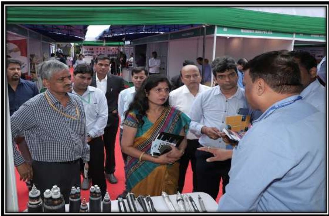
Dignitaries Interacting with Participants during National Vendor Development Programme.