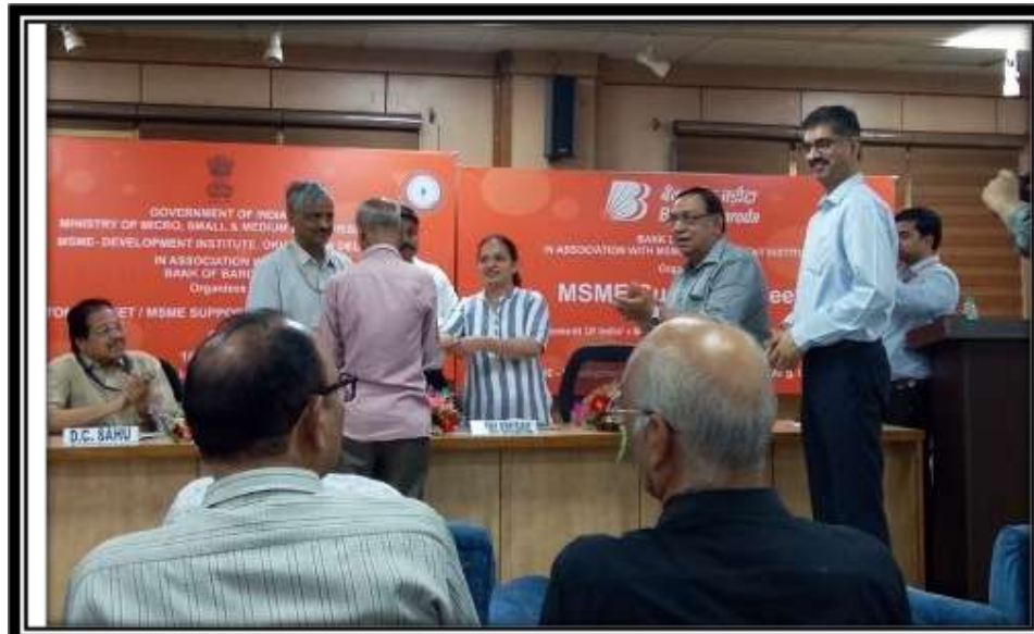
Distribution of Sanction Letters during the Programme in association with Bank of Baroda under MSME Support & Outreach on 16.7.19