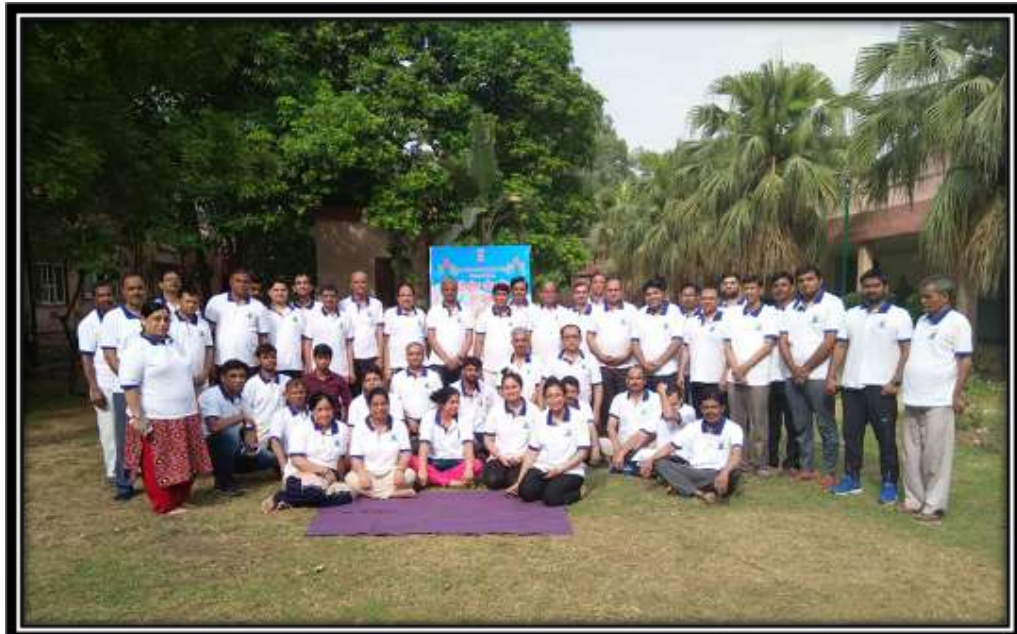
Group Photo of the participating Officers & Staff after participation in Yoga Activity on the occasion of International Yoga Day