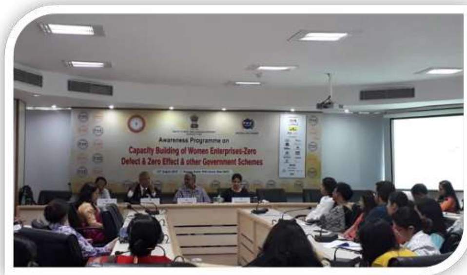
Panel Discussion during the Awareness Programme on Zero Defect & Zero Effect on 19.8.2020 at PHD House, New Delhi.