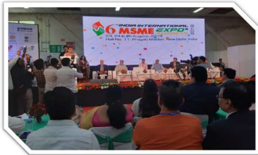
Shri Nitin Gadakari, Hon'ble Minister of M/o MSME, Govt. of India, addressing the participants during the inaugural function