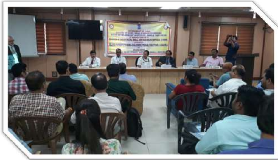
Awareness Seminar on Delayed Payments to MSME-Challenges, Probable Solutions & Loan Mela held on 28.06.2019