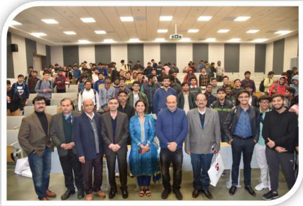
Participants attending the IMC Youth programme at Bennett University, Greater Noida on 06 th To 07 th February, 2019.