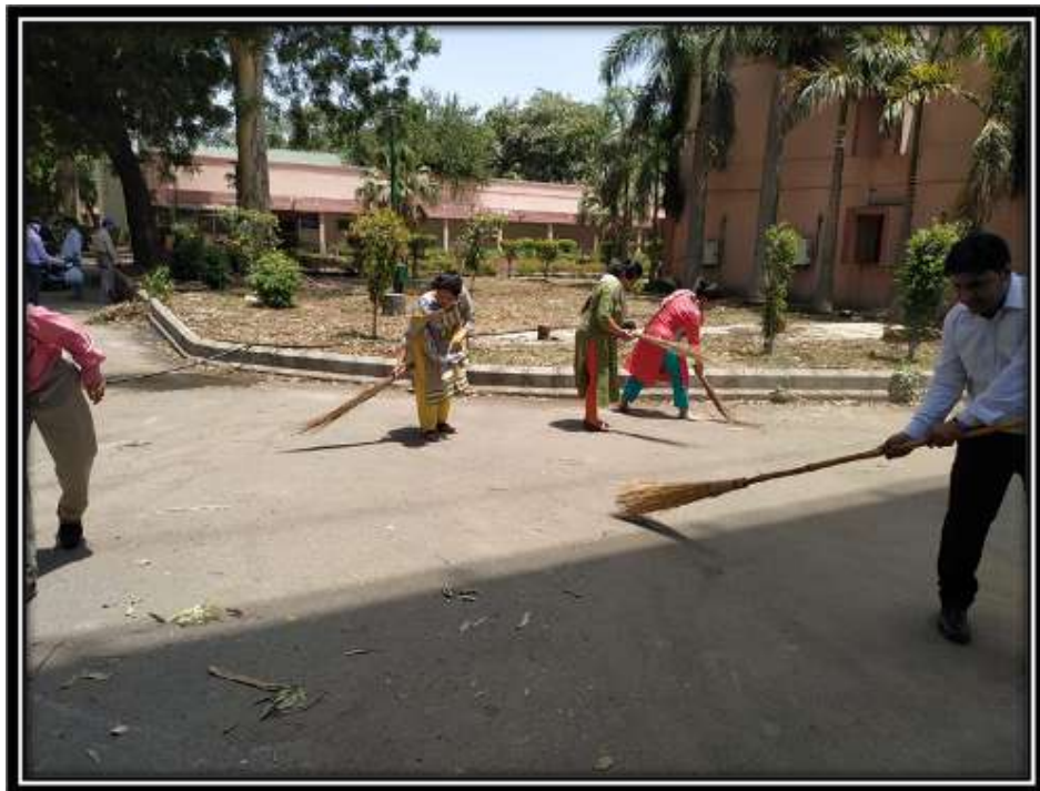
Swachhata Campaign in the premises of Office