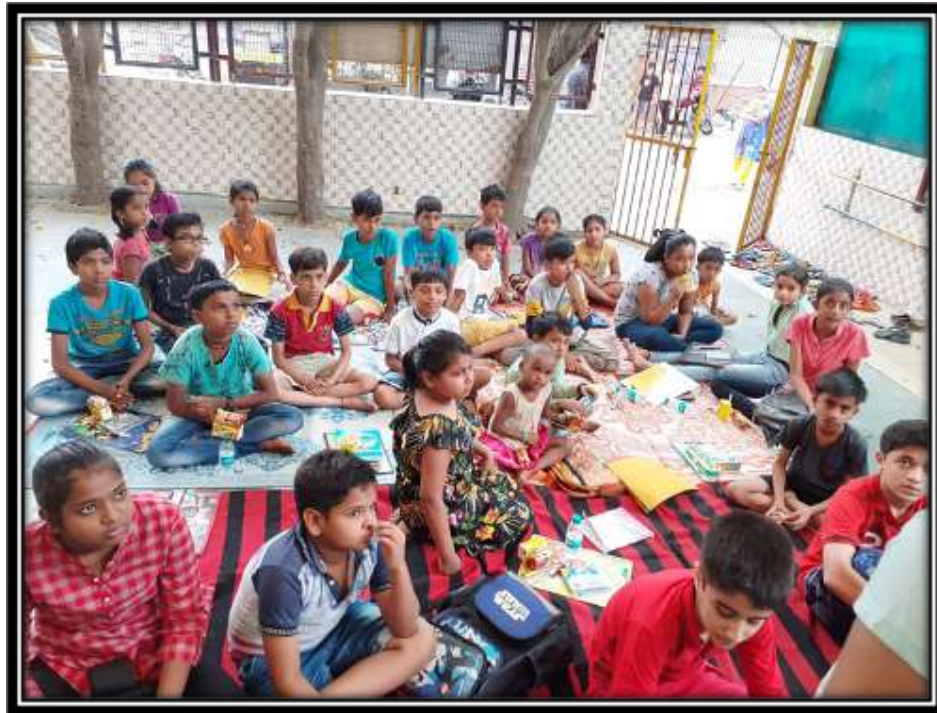
Swachhta activity in the School