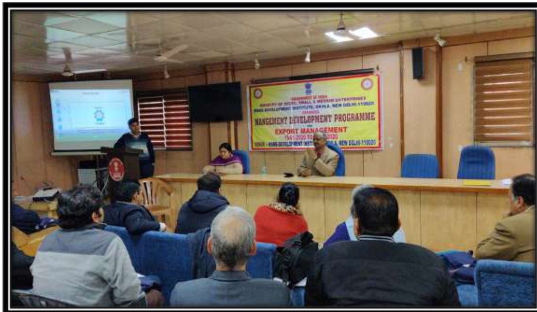
Interaction with the Participants during the valedictory function of MDP on Export Management on 17. 1. 2020 at MSME-DI, Okhla, New Delhi