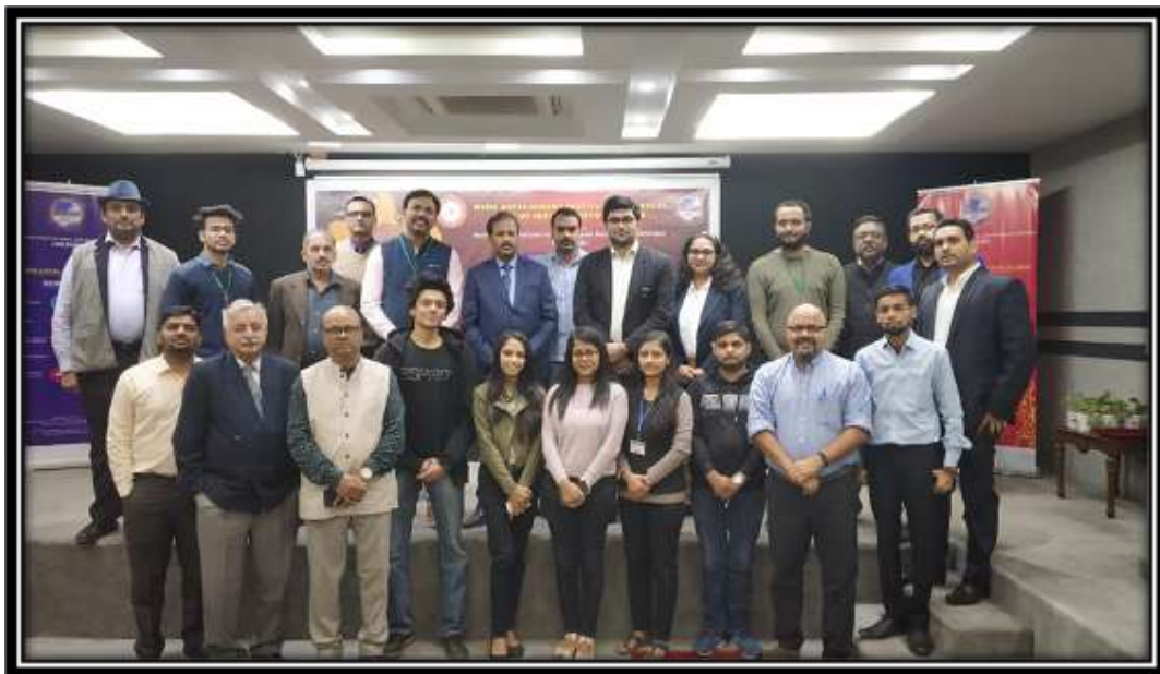
IPR Programme organized at WASME, Noida, UP on 20.11.2020