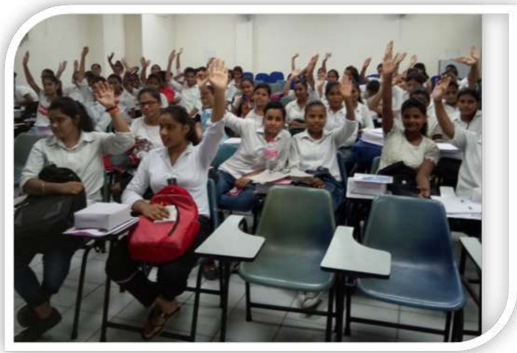
Participants attending the IMC Youth at Meera Bai Institute of Technology, New Delhi with full Zeal & Enthusiasm on 12.9.2019