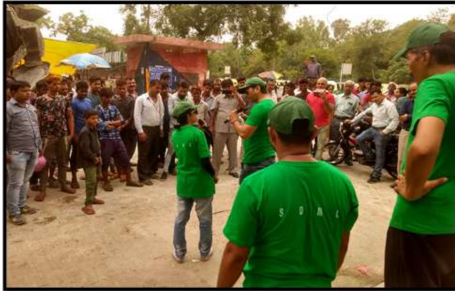
Nukkad Natak for educating segregation of Dry & Wet Waste