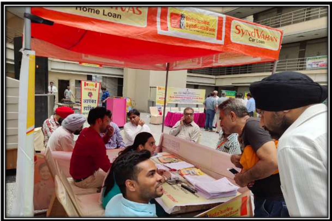
View of Bank officers explaining the loan schemes during Loan Mela on 27 th May, 2020