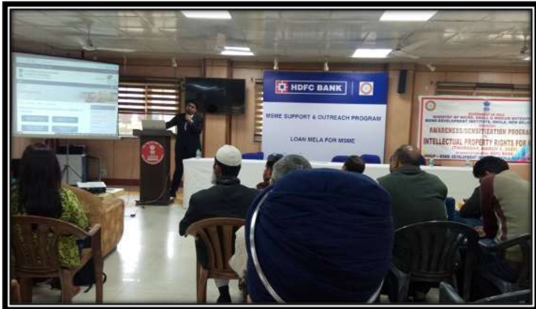
Faculty giving the Presentation on Patent & Copyrights during the programme on 6 th March at MSME-DI, Okhla, New Delhi