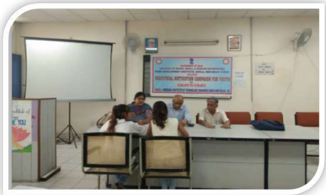
Officers interacting the participants during Industrial Motivation Campaign for Youth on 13.09.2019 at Meera Bai Institute of Technology, New Delhi