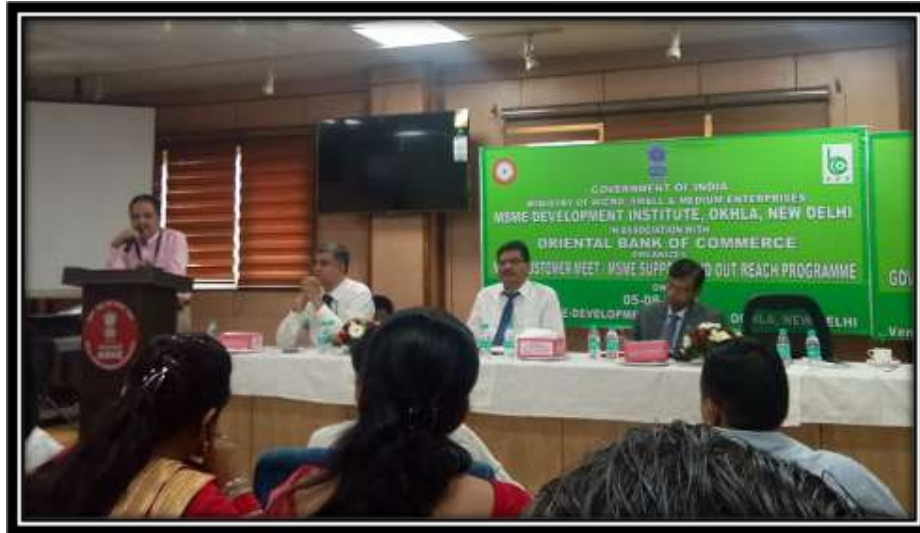
Awareness programme with Oriental Bank of Commerce, New Delhi under MSME Support & Outreach on 05.8.19

MSME- Development Institute has organized various awareness programmes cum loan melas in association with Bank of Baroda, Oriental Bank of Commerce, Allahabad Bank, Syndicate bank etc. under MSME Support and Outreach Programme in the conference hall of the Institute. Financial schemes of respective banks were also made aware to them. Sanctions letters were also distributed to beneficiaries during the programmes.