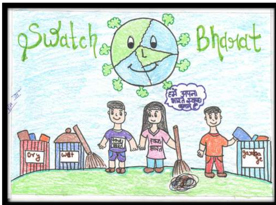
Glimpse of the Art work done by the children