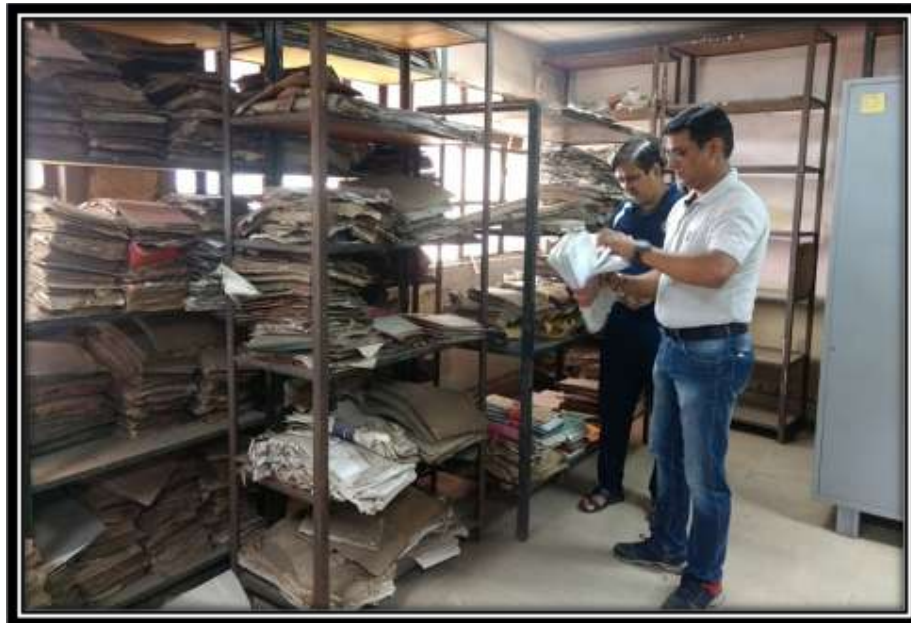
Cleaning the Record Room