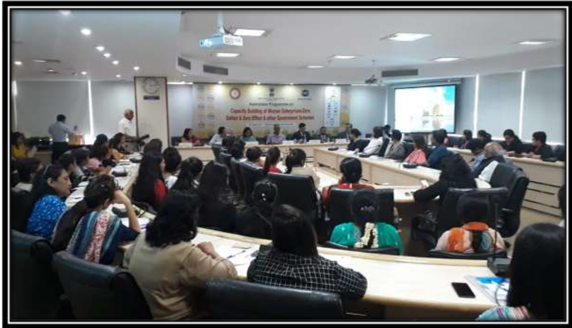
View of Participants attending the programme