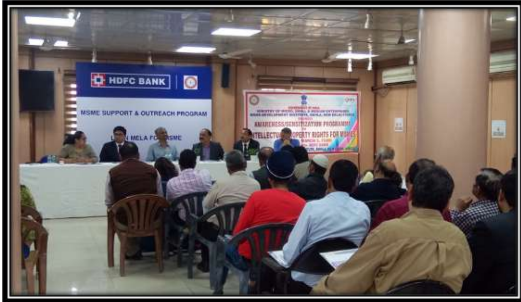
Speakers Interacting with the participants during the Programme on 5 th March, 2020 at MSME-DI, Okhla, New Delhi