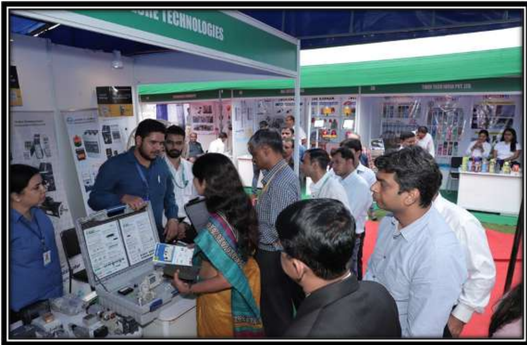
Dignitaries Interacting with Participants during National Vendor Development Programme.