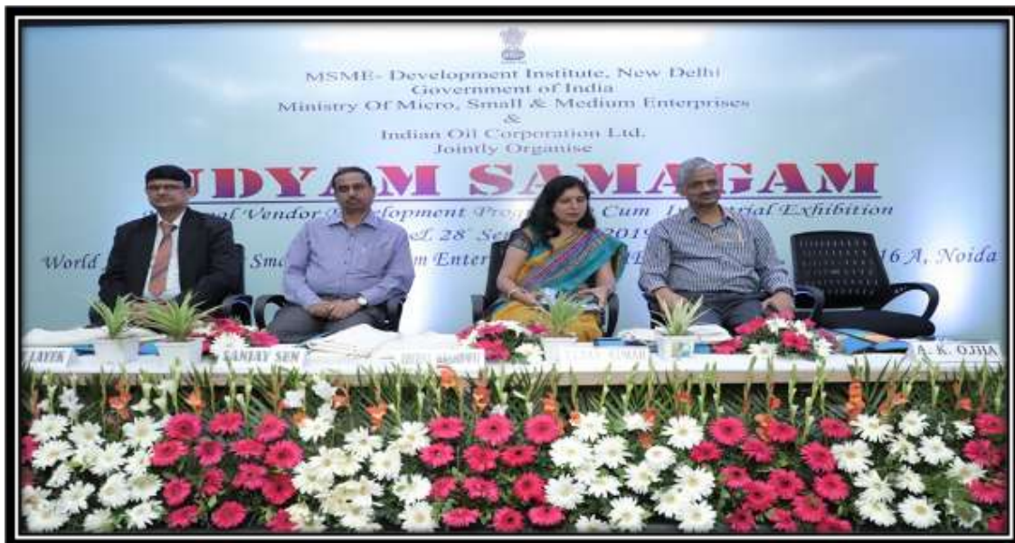
Dignitaries on Dais during Inaugural Function of National Vendor Development Programme at WASME, Sector-16A, Noida on 27 th September, 2019.