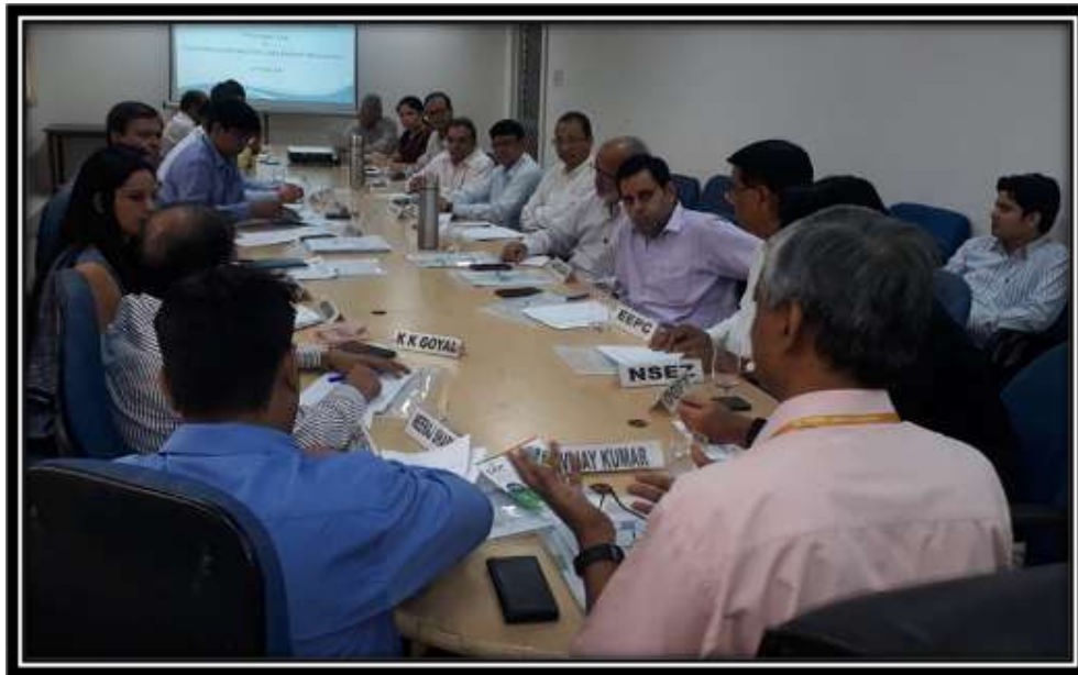
Discussion with Stakeholders during the Meeting