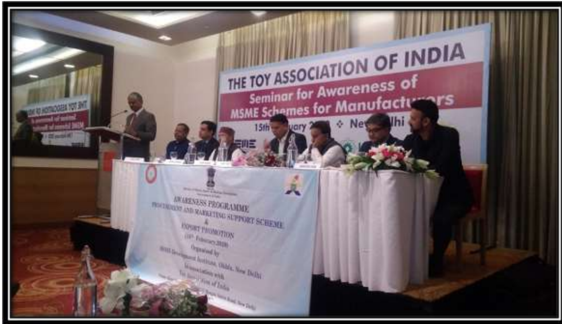
Director, MSME –DI, New Delhi addressing the participants during the Programme