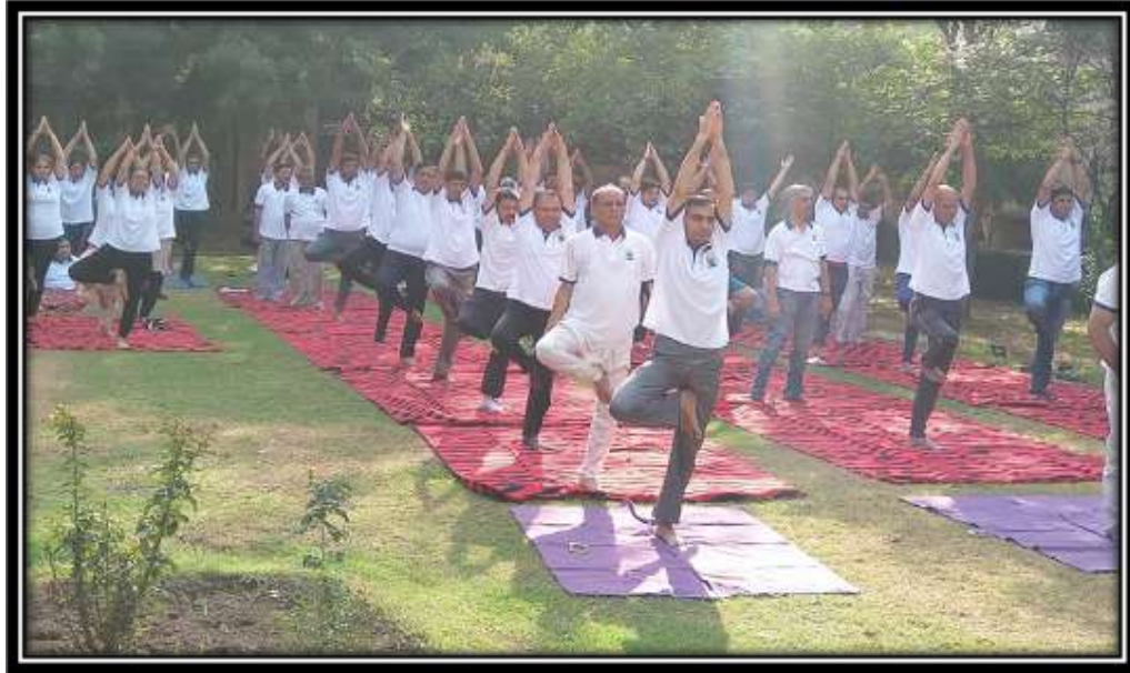
Group Photo of the Officers & Staff during International Yoga Day on 21 st June, 2020 in the premise of the Institute

The officers and staff of the Institute actively participated on the occasion of International Yoga Day on 21 st June, 2019 in the premise of the Institute.